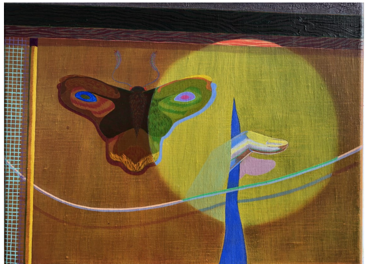
Alex Jackson, Color Theory for Ghost , 2021, oil and linen, 9 x 12 inches