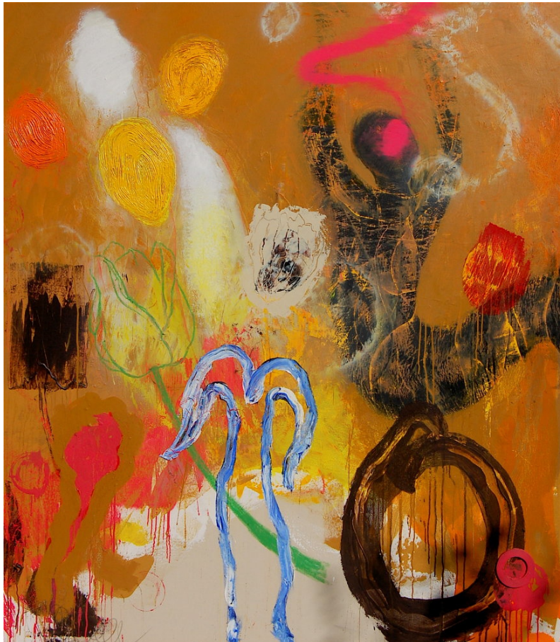
Dewey Crumpler Water Mix , 1998 acrylic on canvas 82 x 74 inches signed verso