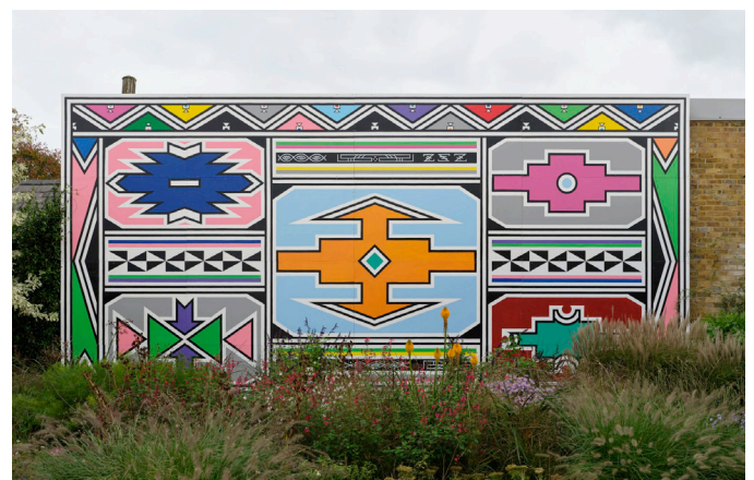
Dr. Esther Mahlangu, Umntu ngumuntu ngabantu, 2024. Serpentine Galleries, North Garden, London, UK. 2024-25.

“While I may be seen as a pioneer, I am simply carrying on the traditions that have been entrusted to me,” Mahlangu explained, “My innovations are a natural progression of the ancestral knowledge passed down through generations. We rejoice for those who have paved the way for us in life.”