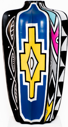
Dr. Esther Mahlangu, Ndebele Abstract , 2025, Acrylic on GRP, 31.5 x 15.75 x 15.75 inches (80 x 40 x 40 cm)

has grown, Mahlangu has further explored how sculptural surfaces hold the potential for her painting, ranging from abstract three-dimensional forms to mundane household objects, all surfaces holding aesthetic potential unbounded. In addition, Mahlangu remained committed to the mural practice, continuing to explore the art form with projects such as the Serpentine Gallery outdoor mural, on view through September 28, 2025; as well as the current Louvre Abu Dhabi video mural, on view through May 25, 2025. At night visitors can enjoy the stunning work Projection of harmony against the museum’s architecture.