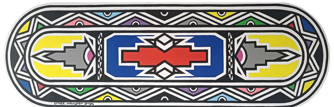
Dr. Esther Mahlangu, Untitled , 2024, Acrylic on canvas, 19.75 x 63 in (50 x 160 cm)

When Heart and Mind Agree opens Saturday, March 15, 2025, from 11 am to 2 pm, at Jenkins Johnson Gallery, San Francisco. Installed at the former McEvoy Foundation space at 1150 25th Street, a 6000sqft venue, the exhibition remains on view through May 3, 2025. The exhibition will be open Tuesdays through Saturdays, 10am - 6pm. For more information please contact the gallery at press@jenkinsjohnsongallery.com . All photos courtesy Jenkins Johnson Gallery.