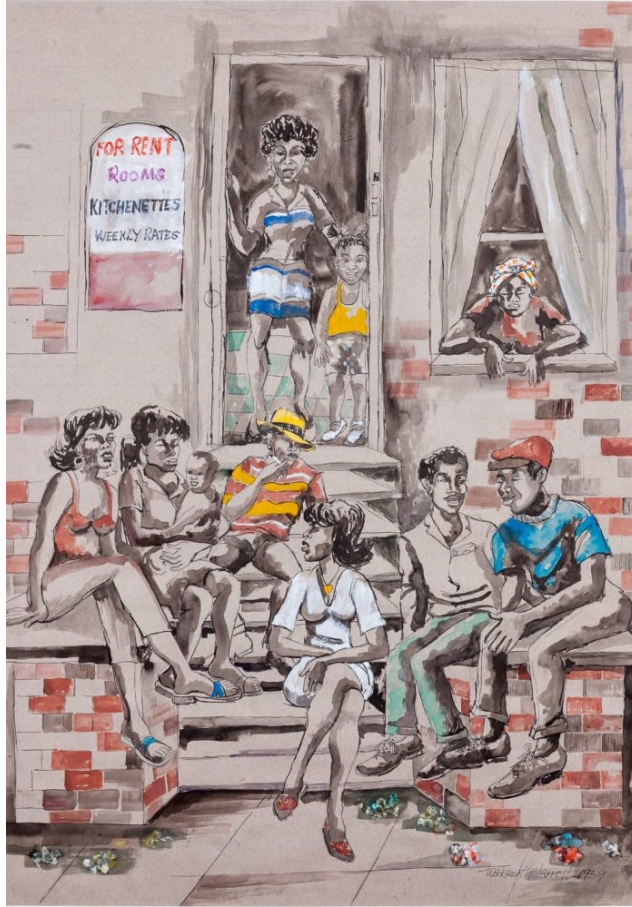
Wadsworth Jarrell Come Saturday, 1959 watercolor and ink on paper 43 x 32 inches signed recto