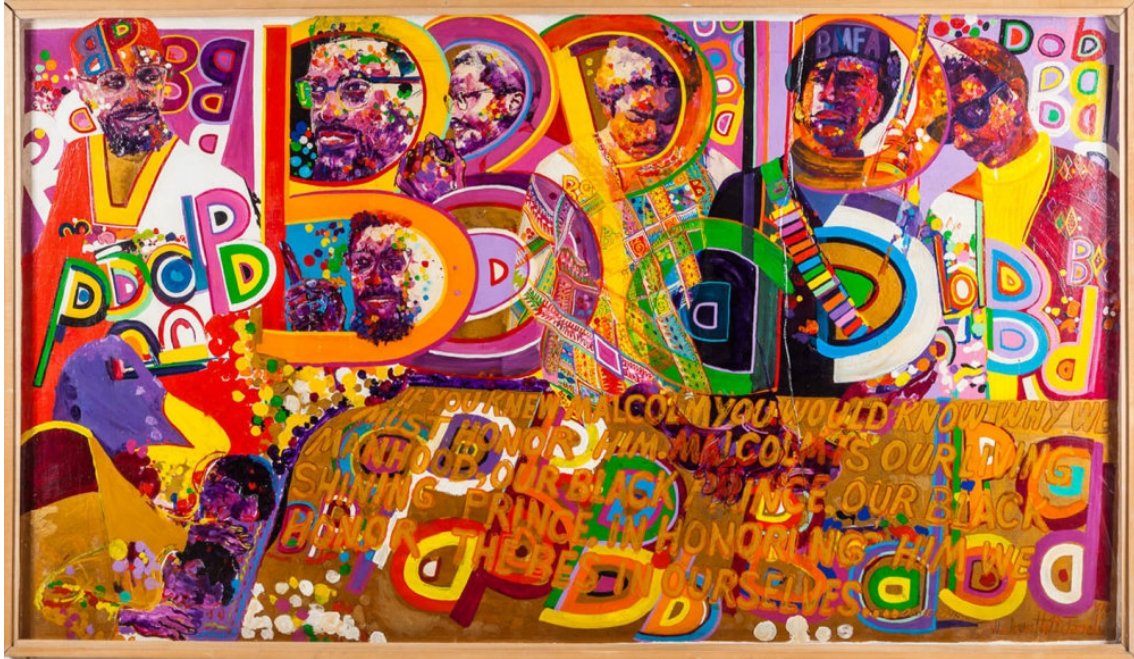
Wadsworth Jarrell Homage to a Giant, 1970 acrylic on board 48 x 90 x 3 inches signed recto