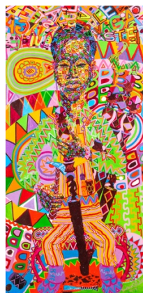
Wadsworth Jarrell, Navaga , 1974, acrylic on canvas, 50 x 24 inches